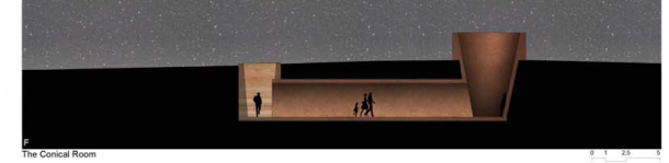
The Conical Room