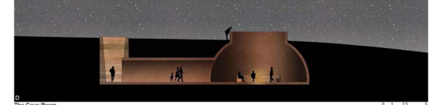
The Cave Room