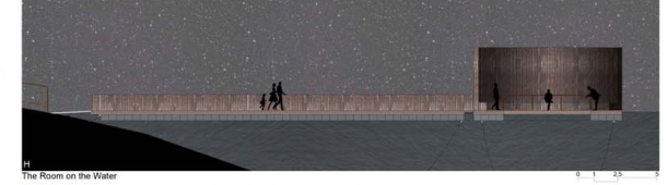
The Room on the Water